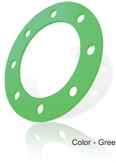
Color - Green